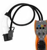
EVSE-01 adapter for testing vehicle charging stations