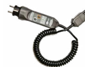
WS-01 adapter with START button (UNI-Schuko plug)