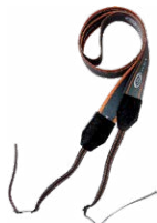
M1 hanging straps