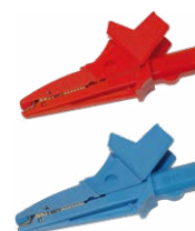
Crocodile clip 1 kV 20 A red / blue