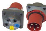
Three-phase socket adapter 63 A