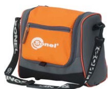
M6 carrying case