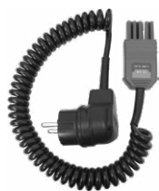
WS-05 adapter (UNI-SCHUKO angular plug)